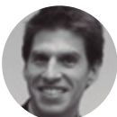
Martí Escursell Venture Capital